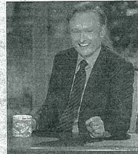
Conan O'Brien will sit at the "Tonight Show" desk one last time when he hosts this evening.